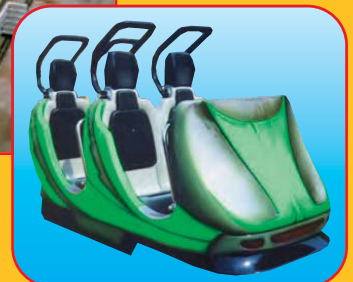
WIND SPECIAL LOOP